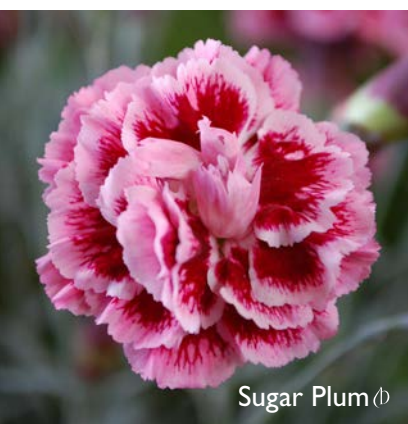
Sugar Plum (D)