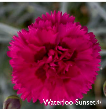
Waterloo Sunset (D)