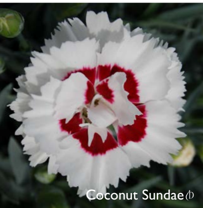
Coconut Sundae (D)