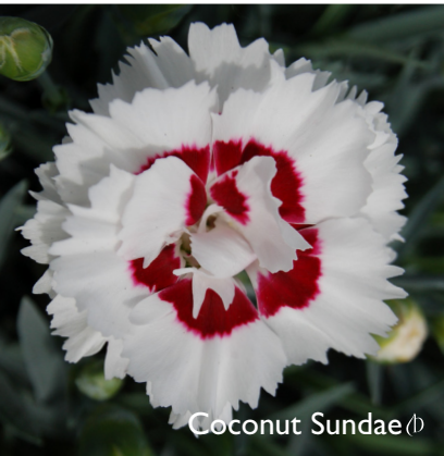
Coconut Sundae (D)