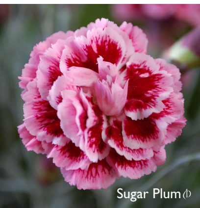
Sugar Plum (D)