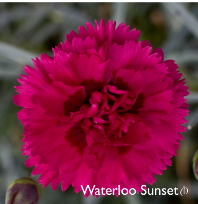
Waterloo Sunset (D)