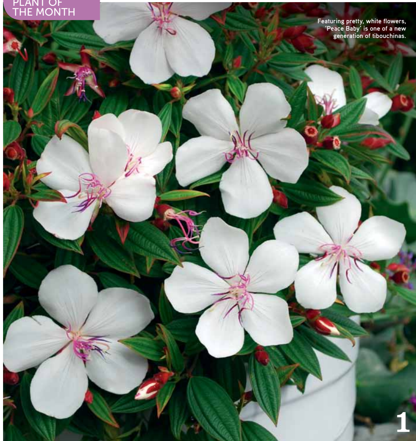
Featuring pretty, white flowers, 'Peace Baby' is one of a new generation of tibouchinas.