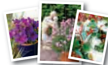
High resolution images