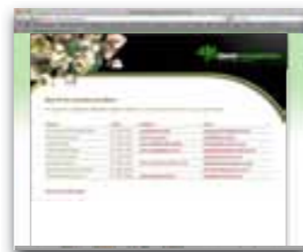
Locate a plant