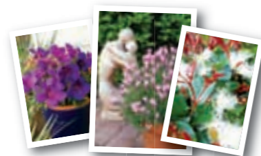
High resolution images